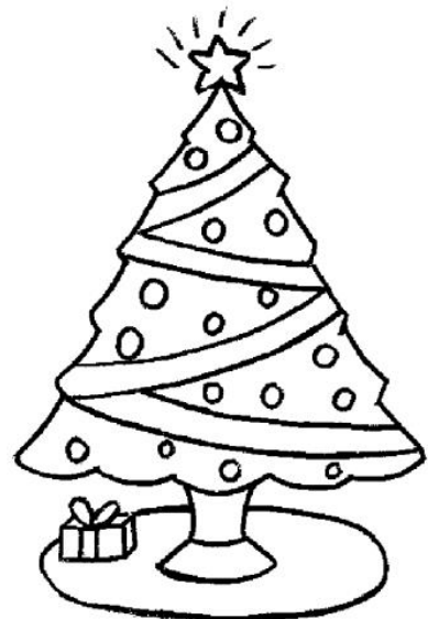
X -mas Tree